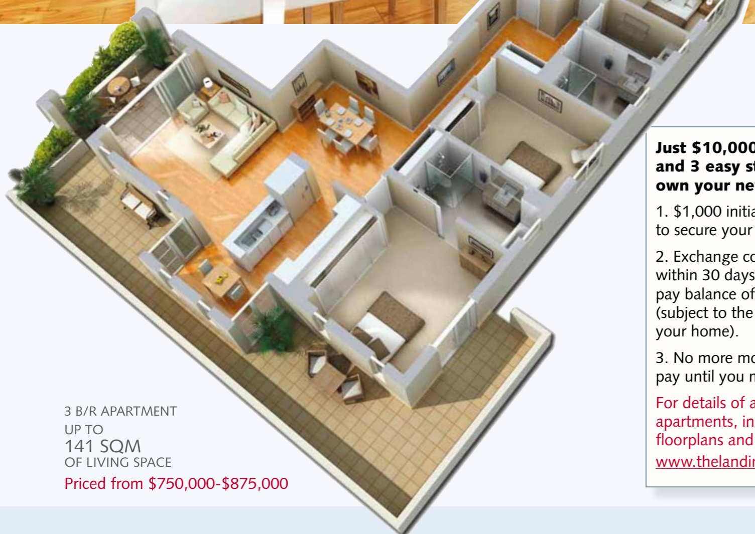
3 B/R APARTMENT UP TO 141 SQM OF LIVING SPACE Priced from $750,000-$875,000