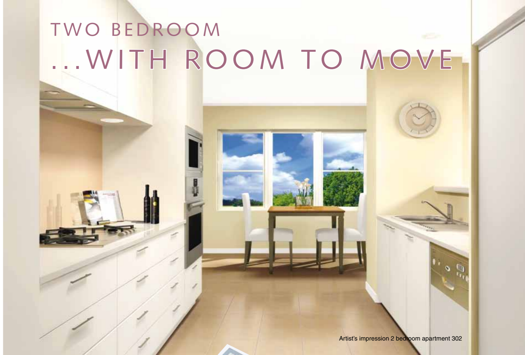
Artist's impression 2 bedroom apartment 302