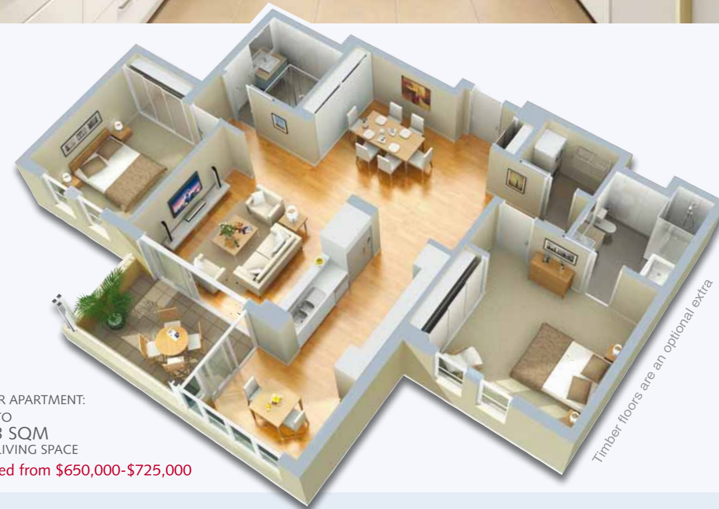
2 B/R APARTMENT: UP TO 113 SQM OF LIVING SPACE Priced from $650,000-$725,000

For details of available apartments, including floorplans and pricing: www.thelandings.com.au