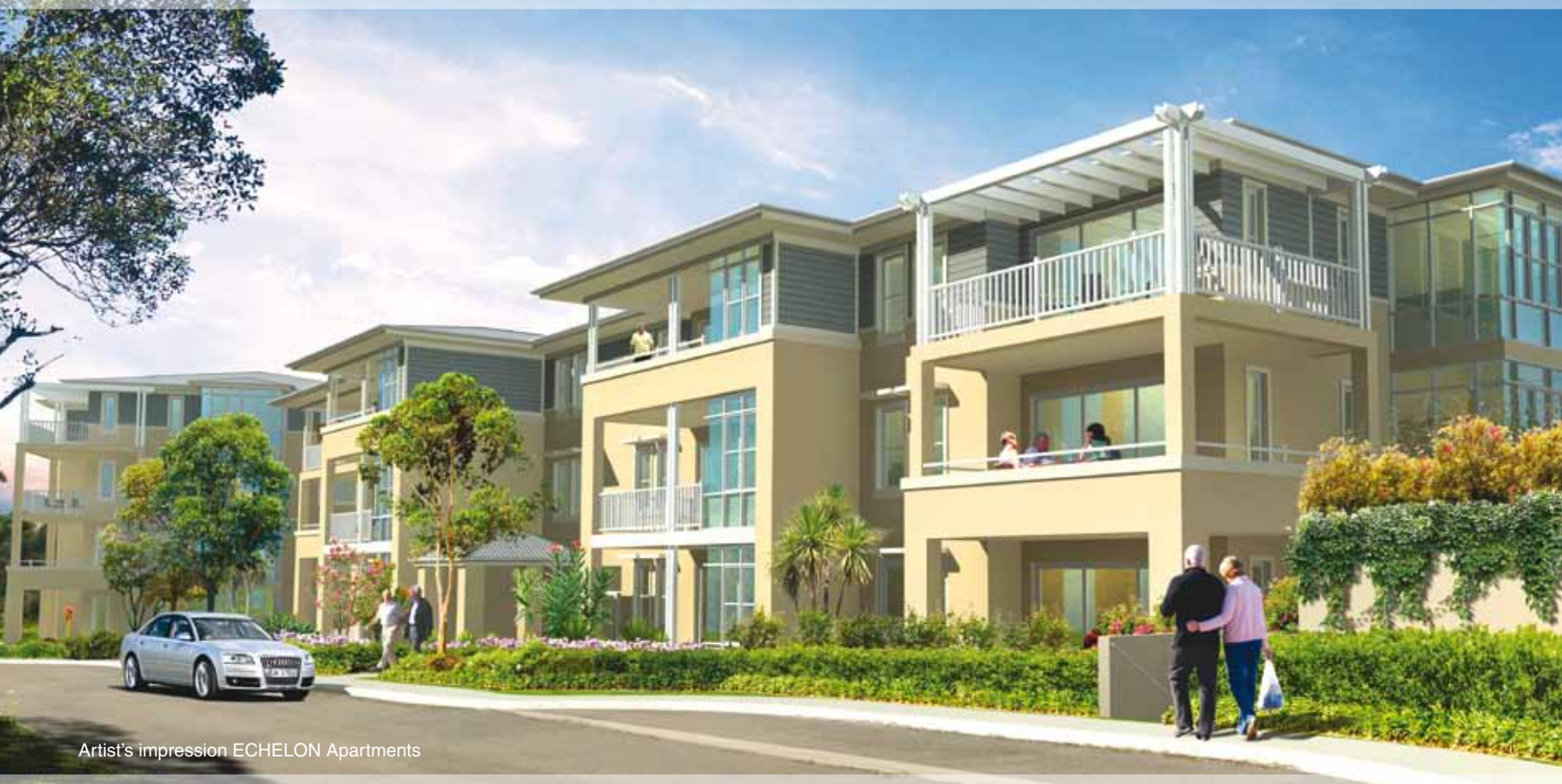
Artist's impression ECHELON Apartments