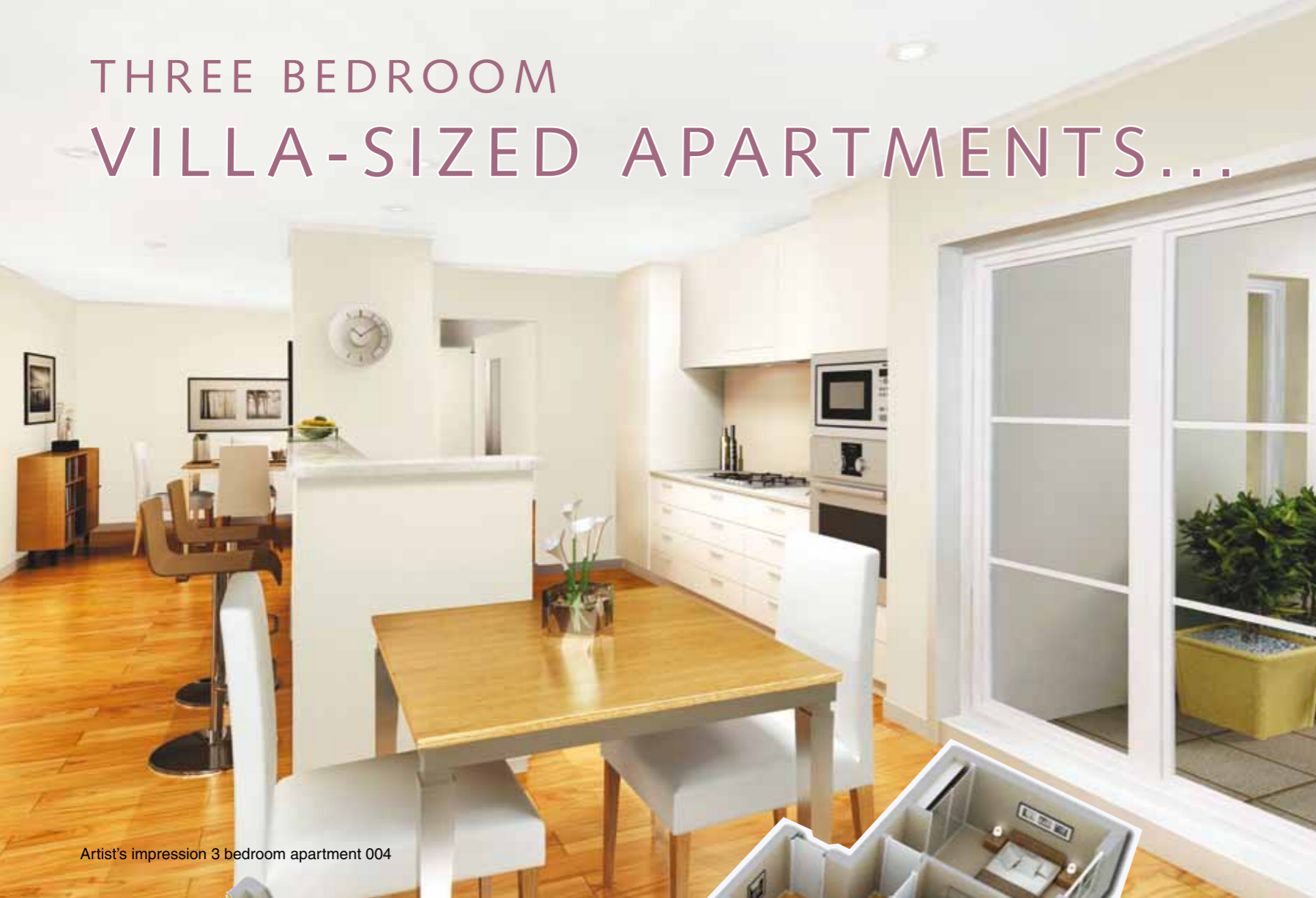
Artist's impression 3 bedroom apartment 004