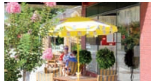
Close to everything you need