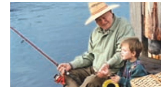
Offering security and peace of mind

The only way to experience The Landings is to come and see for yourself. Call us today to arrange an inspection. We're open seven days a week from 10am to 4pm.