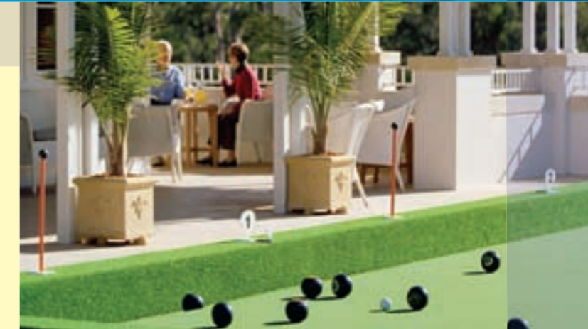
A competition standard bowling green adjoins the Clubhouse