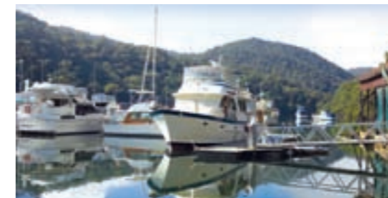
Minutes from the waterways of Bobbin Head