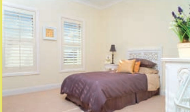
Space to move in these luxury apartments of generous proportions