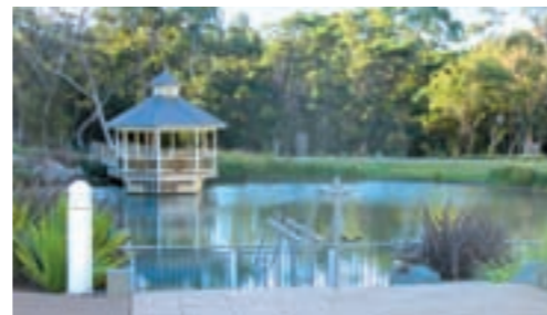
Surrounded by natural beauty