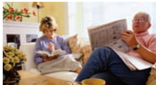
Relax at home or enjoy the village facilities