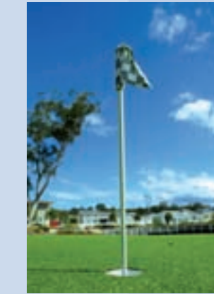
Sharpen your skills on our putting green or visit the clubs nearby

If you're sports minded, you'll find parks, bowling clubs, tennis courts, and some of Sydney's finest golf courses, all close by – including North Turramurra Golf Links, Pymble Golf Club and the exclusive Avondale Golf Course. North Turramurra Bowling Club is just a few minutes away – and of course, you have The Landings' own bowling green and putting green to enjoy every day.