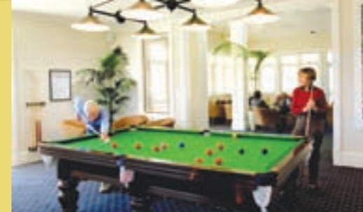
A billiards room is one of the many Clubhouse amenities

restaurant meals, a game of pool, social barbecue or coffee, tai chi classes or a round of bowls on the adjoining green. You will never be short of friends or a helping hand.