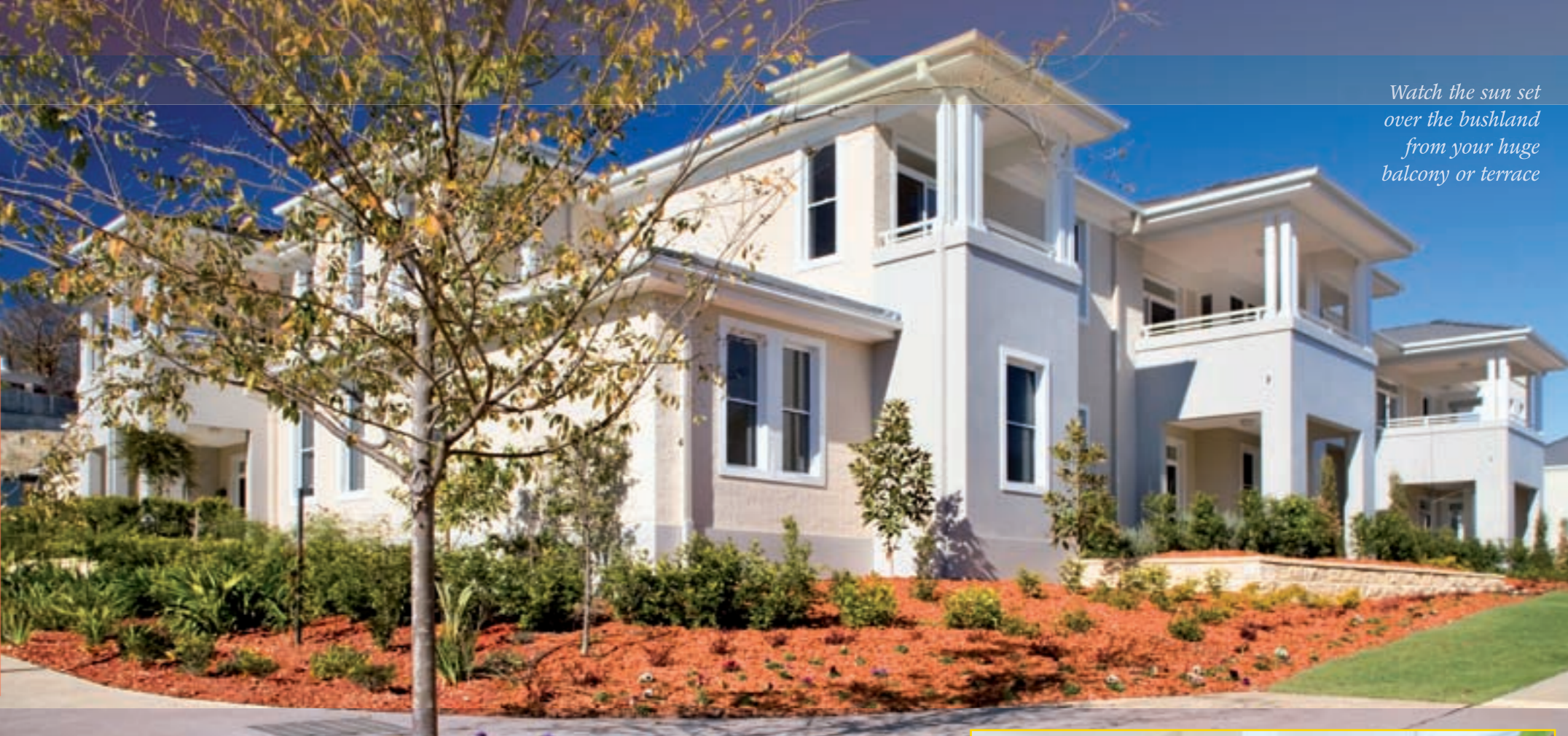
Watch the sun set over the bushland from your huge balcony or terrace